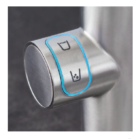
Do you like slightly sparkling water? Do you prefer light bubbles? We have thought of everything. To get a slightly sparkling water, press one button then the other — the LED will then turn turquoise.