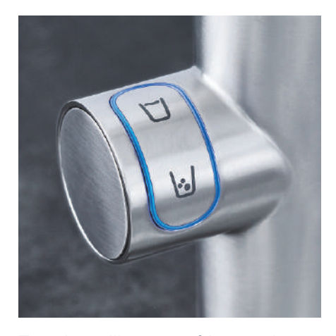
To enjoy still water refrigerated to perfection, nothing is easier: just press the icon on the top of the left handle. A blue LED will light up and your glass will fill with perfect still water.

Enjoy the refreshing & delicious taste of the purest water straight from the kitchen tap – always cooled to the right temperature, with a choice of still or sparkling.