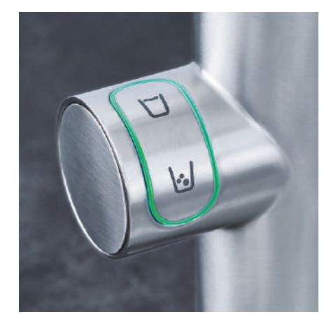
Do you dream of sparkling water with refreshing bubbles? Press the lower icon. The light signal will turn green and your glass will fill with generous bubbles